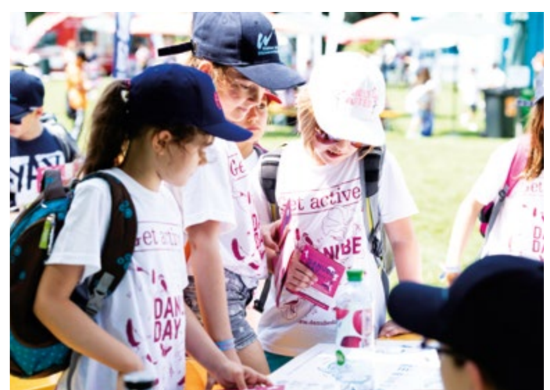
Fig. 6. Austria, Vienna, 2016