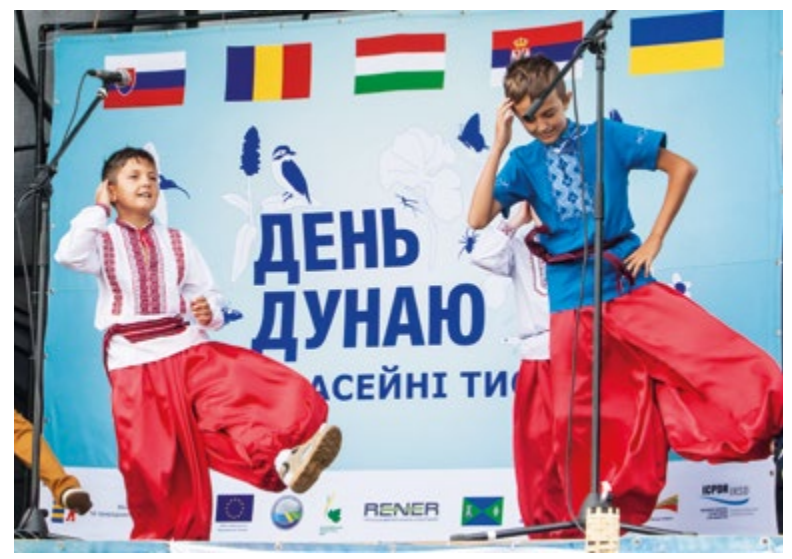
Fig. 8. Ukraine, 2010