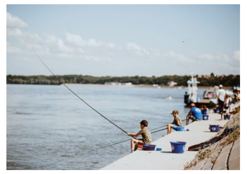
Fig. 7. Austria, 2012