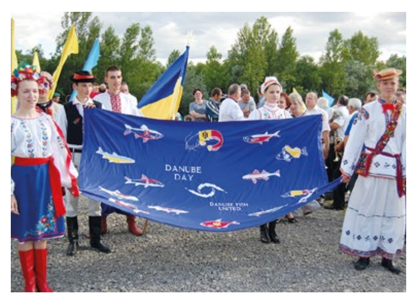
Fig. 5. Ukraine, 2018