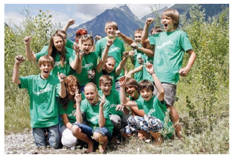
Fig. 2. Croatia, Vukovar, 2023

ISSN 0322-8916 (print), ISSN 1805-6555 (on-line). © 2024 The Author(s). This is an open access article under the CC BY-NC 4.0 licence.