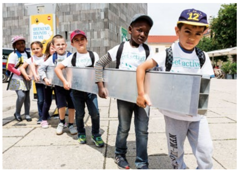
Fig. 4. Austria, Vienna, 2019