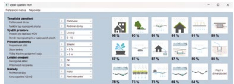
Fig. 2. Presentation of MCA results in the „Measure selection“ module

MCA results are shown both graphically and numerically. Each measure is assigned a pictogram within the RWM. Pictograms are sorted in descending order based on the achieved point score from the MCA. The relative value of the score (max. 100 %) is shown under the relevant pictogram. The presentation of MCA results in the „Measure selection“ window is shown in Fig. 2. After clicking on the pictogram, the user is shown a detailed description of a specific RWM measure and its application in practice.