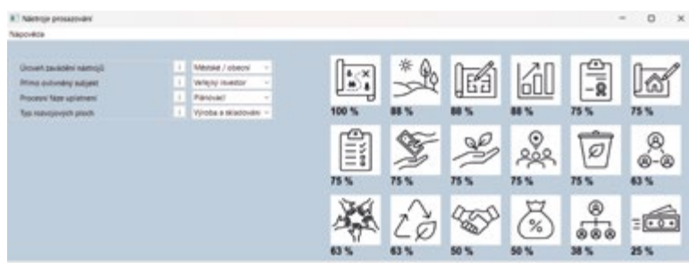
Fig. 4. Graphic form of the „Enforcement tools“ module

The „Enforcement tools“ module is primarily intended for the public administration representatives. It is an overview of tools that can be used to support and promote effective stormwater management in urban and municipal development sites. The individual tools are based on published general lists of tools and their specifications. They are categorized according to the hierarchical level of public administration, the subject concerned, and the phase of the process (planning, implementation, operation). The goal is to find the most suitable tool for the given situation. In total, 18 types of instruments are processed, divided into 5 categories (normative; conceptual; coordination and organizational; economic; voluntary and ethical) [16]. The MCA method [11, 12] is again used for tool selection. MCA criteria are determined based on the choice of answers (17 possible answers in total) to four initial questions. The presentation of the results is similar to the „Measure selection“ module; it is also possible to go to the detail of the given tool by clicking on the pictogram. The graphic form of the „Enforcement tools“ module is shown in Fig. 4.