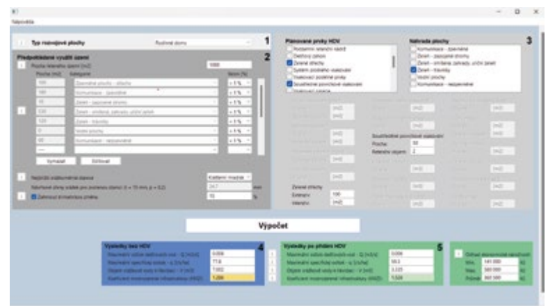
Fig. 3. Graphic form of the „Measure dimensioning“ module

In this module, the user can simply calculate the values of selected hydrological characteristics in the area and the effect of the selected RWM measure on these values. The user can thus evaluate the necessary scope of the planned measure, its effectiveness, or price. The graphic form of the „Measure dimensioning“ panel is shown in Fig. 3.